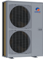
Condensing Unit 60,000 BTU/h