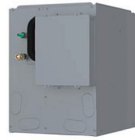
Cased Coil UNIX R32