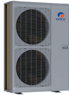
Condensing Unit 60,000 BTU/h