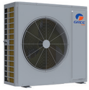
Condensing Unit 36,000 BTU/h