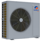
Condensing Unit 36,000 BTU/h